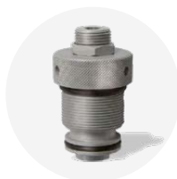
Pressure maintaining valve

■ Pressure maintaining valve + BC filling valve