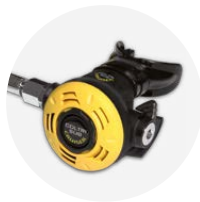
2nd stage regulator