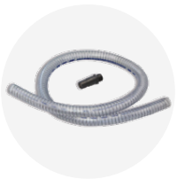
Remote intake kit