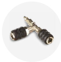
Raccordo a T doppia uscita