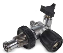
BC DIN 232 bar