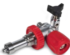
BC DIN 300 bar